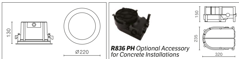
R836 PH Optional Accessory for Concrete Installations